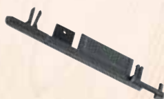
End caps F-EK

for joining two guide tracks Ref. No. 204363