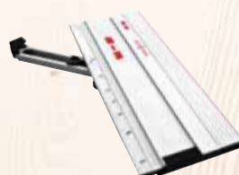
Angle fence F-WA