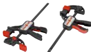
Lever clamp F-SZ 180MM

2 pieces, for fixing rail to work piece Ref. No. 207770