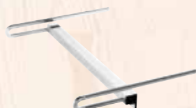
Roller edge guide