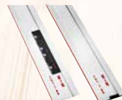
Guide rail F