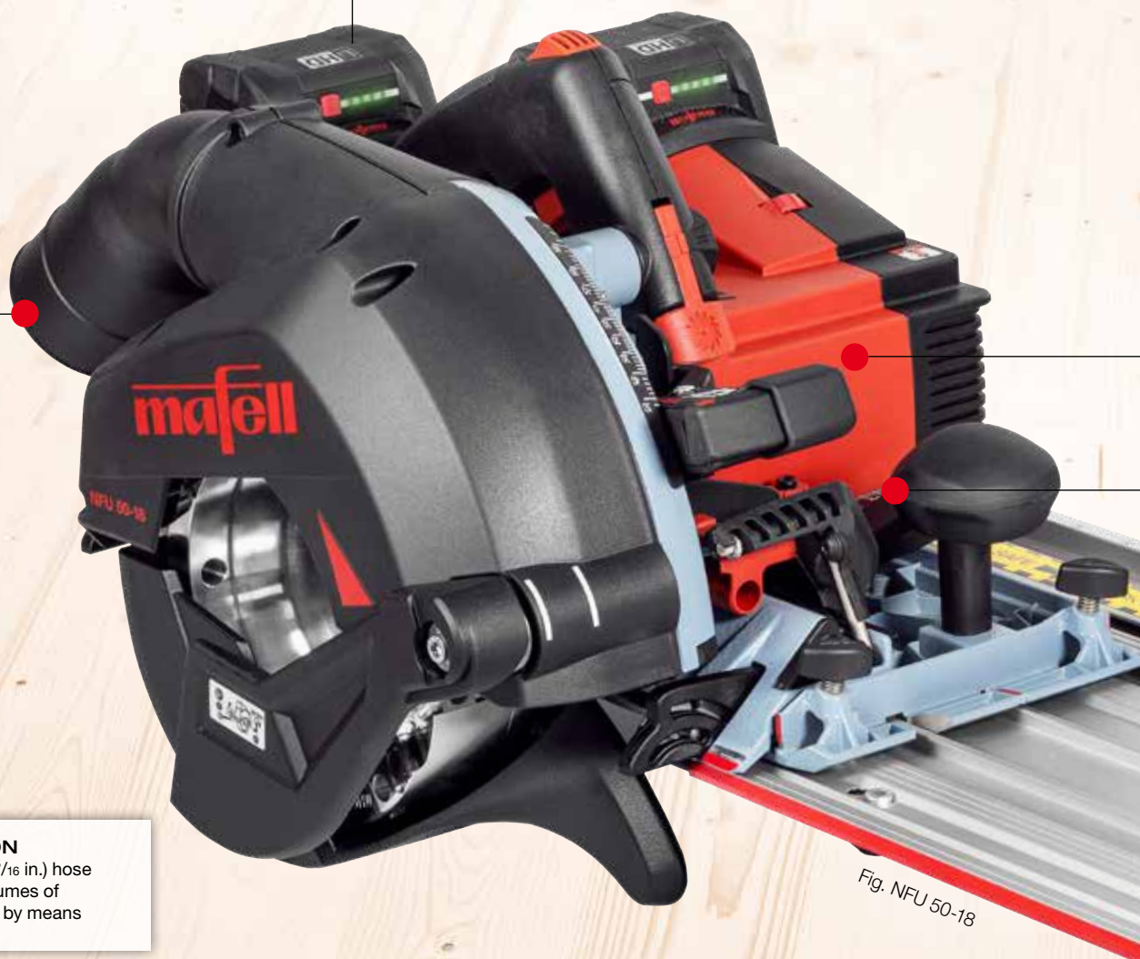
Fig. NFU 50-18

stands for sheer strength and outstanding motive power, and its output is optimized by digital electronics.