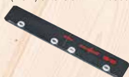
Connecting piece F-VS

for joining two guide tracks Ref. No. 204363