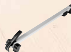
Side fence SA 625