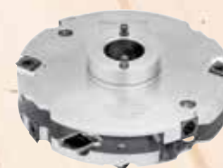
Expanding groove cutter

Ø 163 x 22 until 40mm (6 7/16 x 7/8 x 1 9/16 in.) Ref. No. 091899 Reversible knives (12 required)