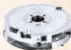
Expanding groove cutter

Ø 163 x 46mm Ref. No. 091902 (6 7/16 x 2 13/16 in.) Reversible knives (12 required)