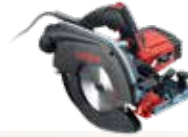
K 65 cc