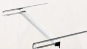
Roller edge guide