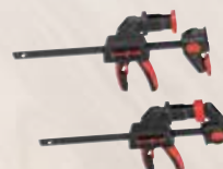
Lever clamp F-SZC 180

Flexible hose FXS L Length up to 3.2 m Order No. 205276