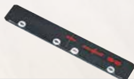
Connecting piece F-VS