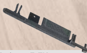
End cap F-EK