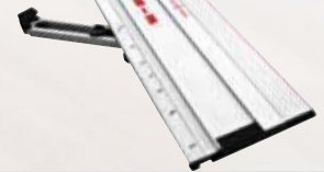
Angle fence F-WA