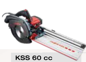
KSS 60 cc