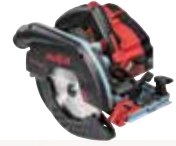
K 65 18M bl