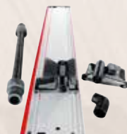
Suction clamping system

Aerofix F-AF 1 With track, top and bottom adapters, flexible hose