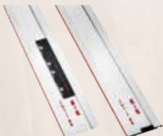
Guide rail F