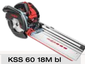
KSS 60 18M bl