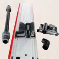
Suction clamping system

Aerofix F-AF 1 suction clamping system with 1.3 m rail, adapters for above and under- neath rail, flexible hose