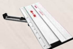
Angle fence F-WA

for joining two guide rails Ref. No. 204363