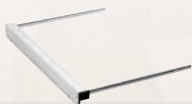
Parallel guide fence K55-PA

Guide pocket set 2 x F-SZ 180 MM + 2 x F 160 + F-VS + guide pocket Ref. No. 209591