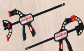
Screw clamp F-SZ 180MM

18 M 144 LiHD, 18 V, 144 Wh Ref. No. 094498