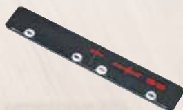
Connecting piece F-VS

Flexible hose FXS-L up to 3.2 m long Ref. No. 205276